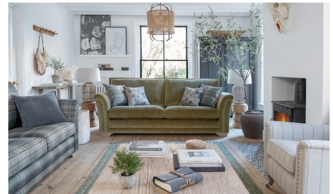
3 seater sofa (standard back) in fabric 4277, large scatter cushions in 4627, grey ash feet. Grand sofa (standard back) in fabric 4629, large scatter cushions in 4277, small scatter cushions in 4120, grey ash feet. Woodstock accent chair in fabric 4550, grey ash/brushed nickel castor legs (C101). (All items shown with optional pewter studding).