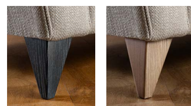
Black ash legs. Weathered ash legs.