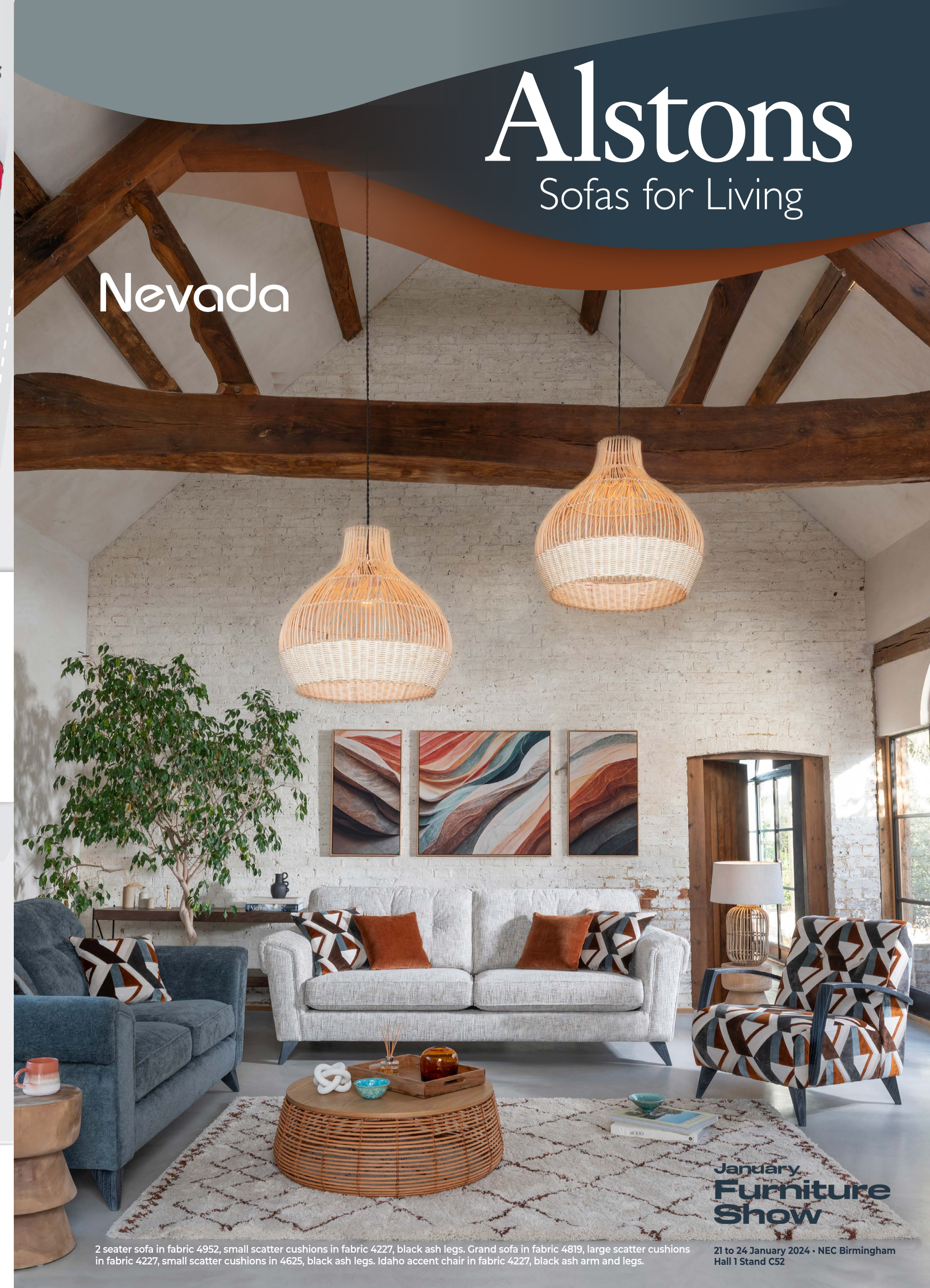
2 seater sofa in fabric 4952, small scatter cushions in fabric 4227, black ash legs. Grand sofa in fabric 4819, large scatter cushions in fabric 4227, small scatter cushions in 4625, black ash legs. Idaho accent chair in fabric 4227, black ash arm and legs.