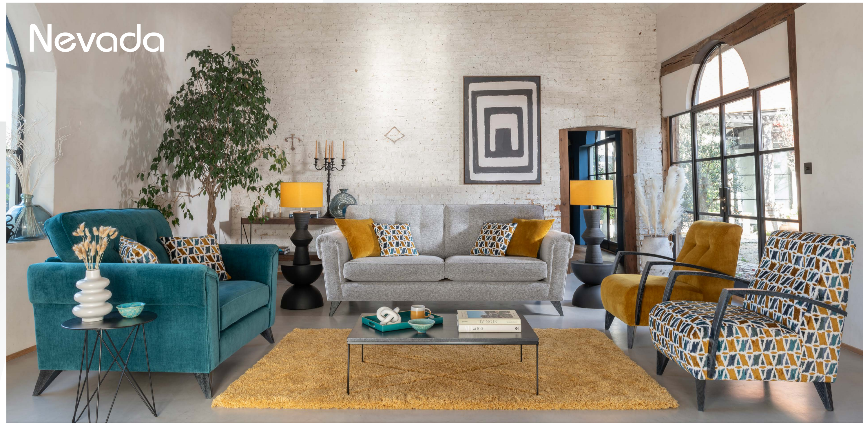
Snuggler in fabric 4622, small scatter cushions in fabric 4113, black ash legs. Grand sofa in fabric 4747, large scatter cushions in fabric 4623, small scatter cushions in 4113, black ash legs. Idaho accent chair in fabric 4623, black ash arms and legs. Idaho accent chair in fabric 4113, black ash arms and legs.