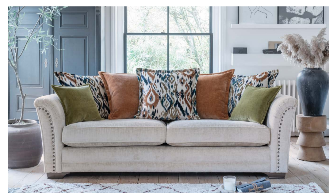
Grand sofa (pillow back) in fabric 4868, 3 pillows in 4040, 2 pillows in 4626, small scatter cushions in 4620, antique ash feet. (Item shown with optional antique studding).