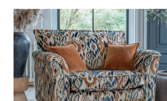
Snuggler in fabric 4040, small scatter cushions in 4626, antique ash feet. (Item shown with 'no stud' option).