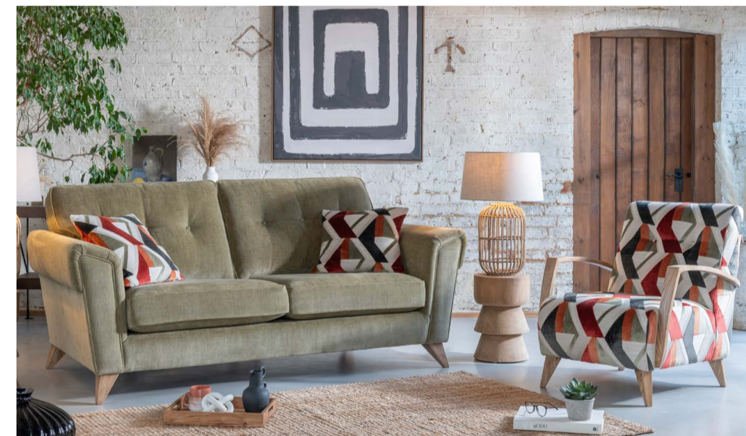
3 seater sofa in fabric 4629, large scatter cushions in 4224, weathered ash legs. Idaho accent chair in fabric 4224, weathered ash arms and legs.