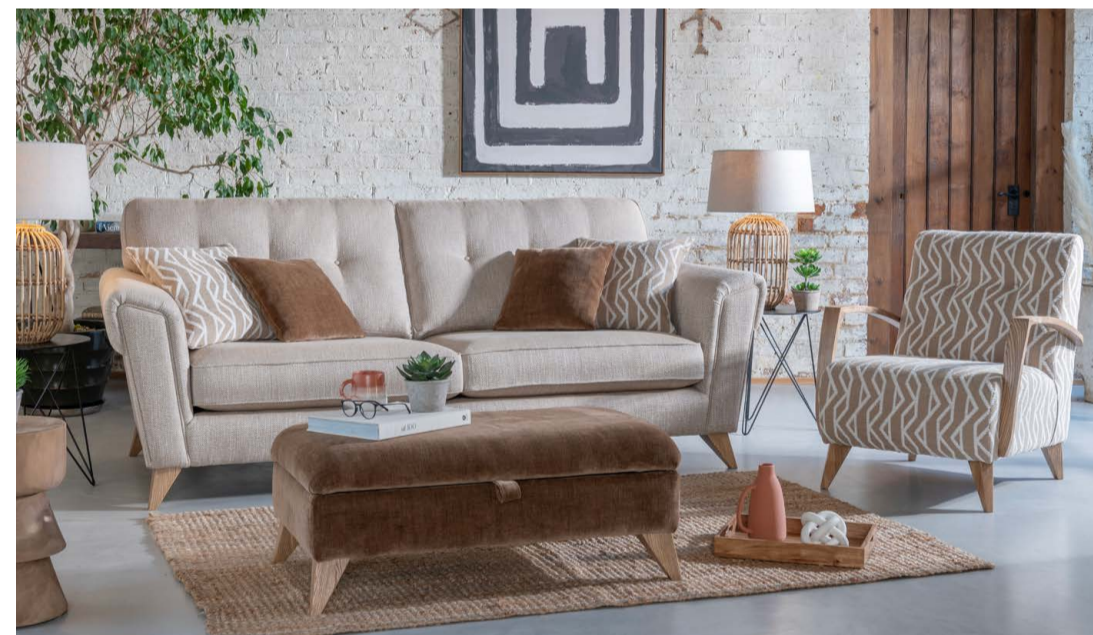
Grand sofa in fabric 4908, large scatter cushions in fabric 4338, small scatter cushions in 4628, weathered ash legs. Idaho accent chair in fabric 4338, weathered ash arms and legs. Legged ottoman in fabric 4628, weathered ash legs.