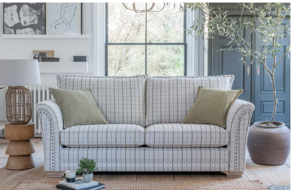
3 seater sofa (standard back) in fabric 4590, large scatter cushions in 4910, grey ash feet. (Item shown with optional pewter studding).