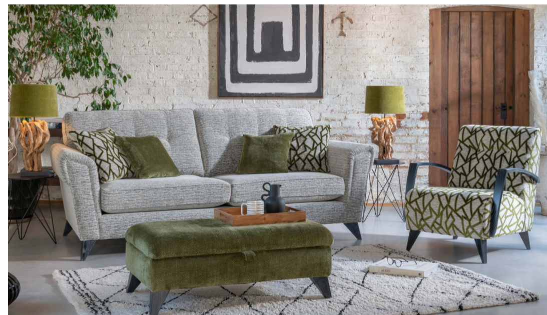
Grand sofa in fabric 4878, large scatter cushions in fabric 4000, small scatter cushions in 4510, black ash legs. Idaho accent chair in fabric 4000, black ash arms and legs. Legged ottoman in fabric 4510, black ash legs.