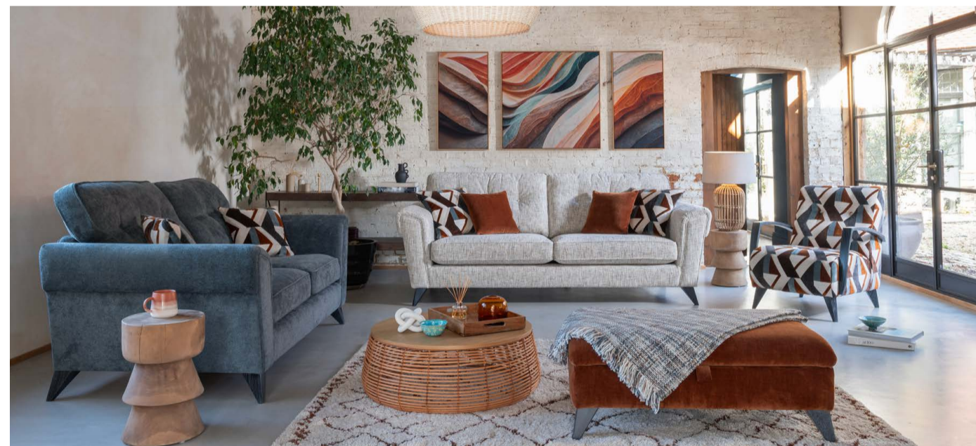
2 seater sofa in fabric 4952, small scatter cushions in fabric 4227, black ash legs. Grand sofa in fabric 4819, large scatter cushions in fabric 4227, small scatter cushions in 4625, black ash legs. Idaho accent chair in fabric 4227, black ash arm and legs. Legged ottoman in fabric 4625, black ash legs.