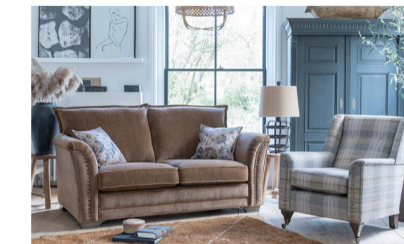
2 seater sofa (standard back) in fabric 4628, small scatter cushions in 4123, antique ash feet. Woodstock accent chair in fabric 4273, antique ash/antique brass castor legs (AC102). (All items shown with optional antique studding).