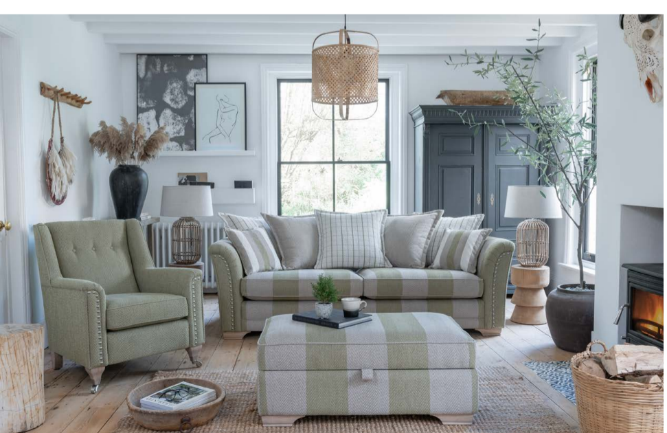
Woodstock accent chair in fabric 4910, grey ash/brushed nickel castor legs (C101). Grand sofa (pillow back) in fabric 4660, 3 pillows in 4590, 2 pillows in 4918, small scatter cushions in 4470, grey ash feet. Ottoman in fabric 4660, grey ash feet. (Woodstock accent chair and Grand sofa shown with optional pewter studding).