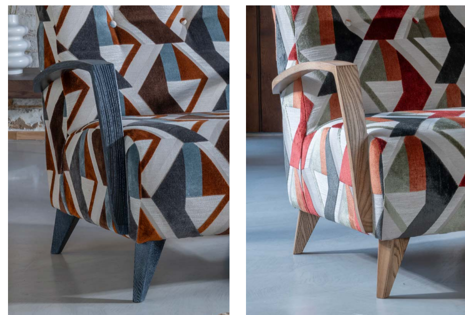
Our new two-tone wood finishes - black ash (left) in fabric 4227 and weathered ash (right) in fabric 4224.