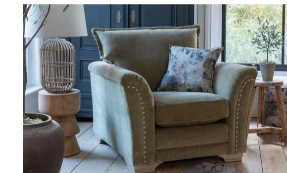
Chair in fabric 4629, small scatter cushion in 4120, grey ash feet. (Shown with optional pewter studding.)