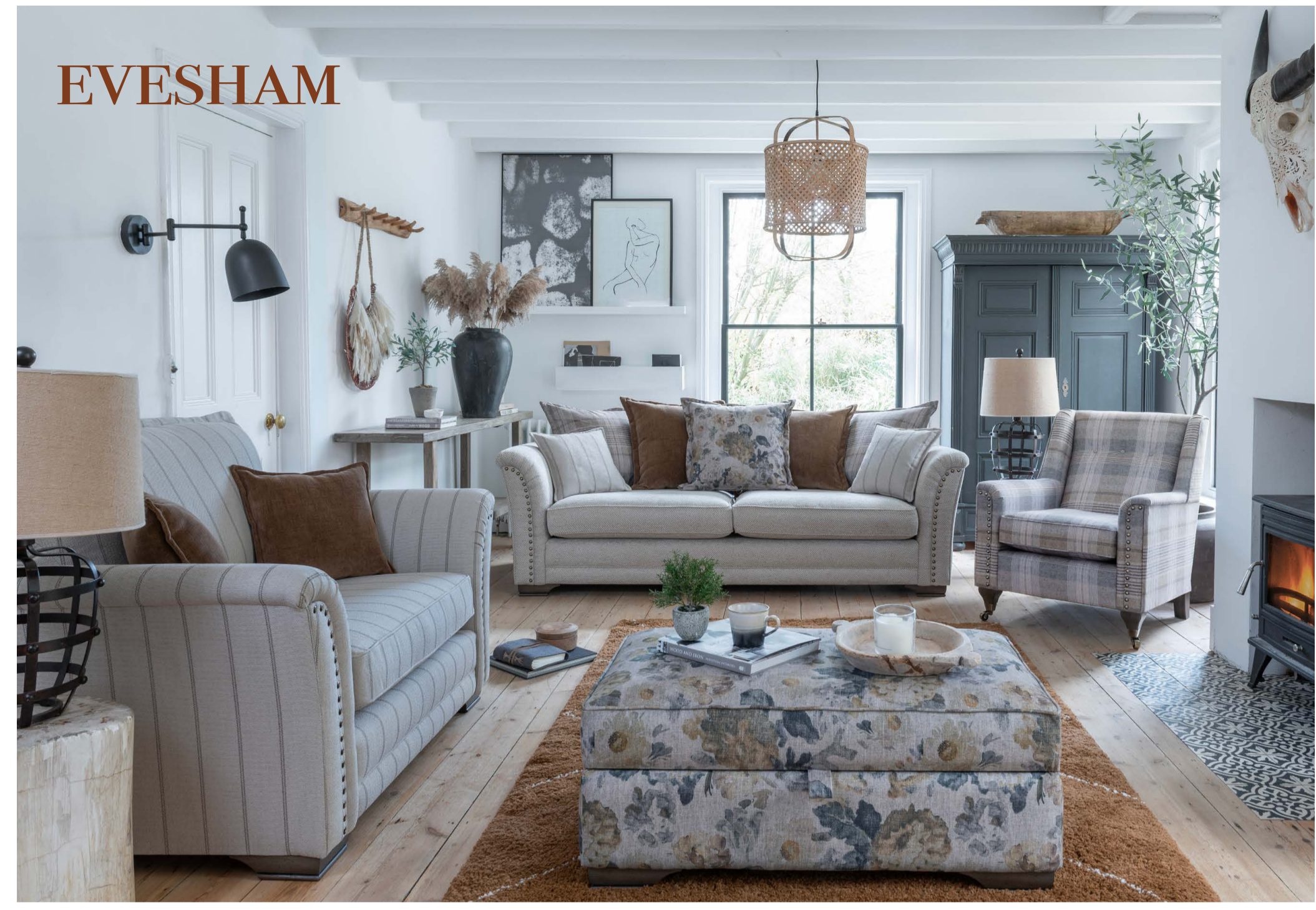
Snuggler in fabric 4555, small scatter cushions in 4628, antique ash feet. Grand sofa (pillow back) in fabric 4738, 2 pillows in 4273, 2 pillows in 4628, 1 pillow in 4123, small scatter cushions in 4555, antique ash feet. Woodstock accent chair in fabric 4273, antique ash/antique brass castor legs (AC102). Ottoman in fabric 4123, antique ash feet. (Snuggler, Grand sofa and Woodstock accent chair shown with optional antique studding).