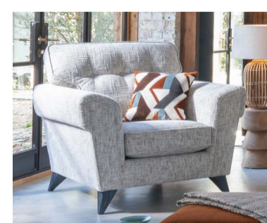
Chair in fabric 4819, small scatter cushion in fabric 4227, black ash legs.